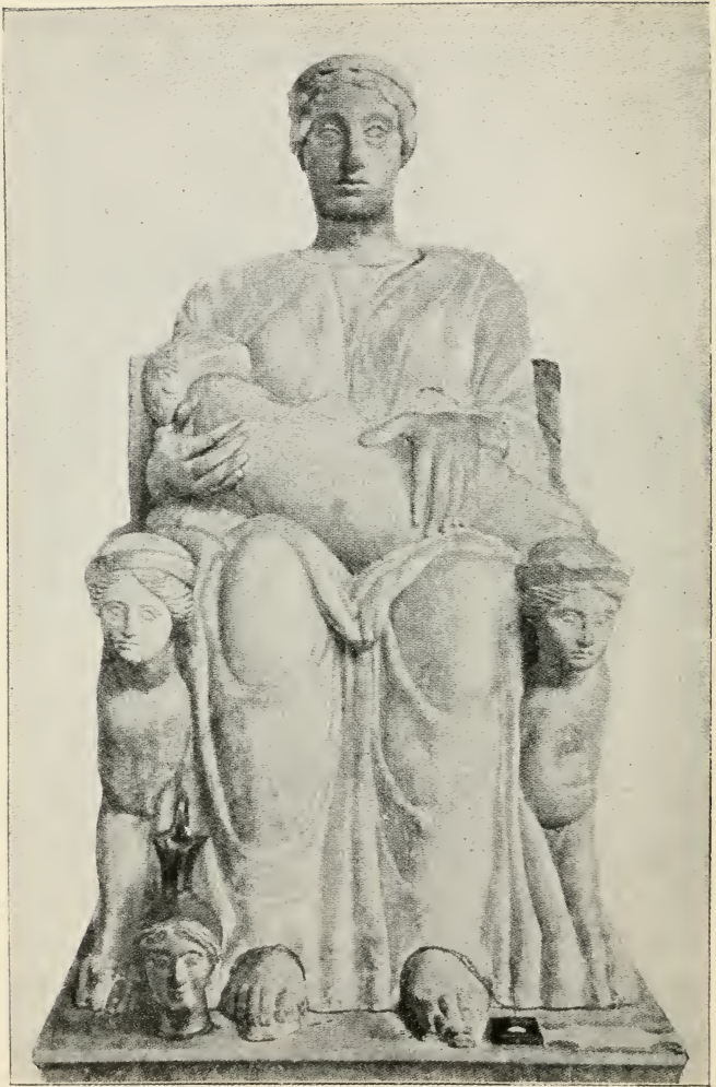
MATUTA, AN ETRUSCAN PIETÀ