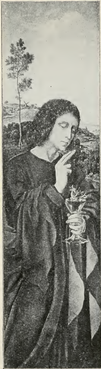
THE DRAGON IN THE GOBLET