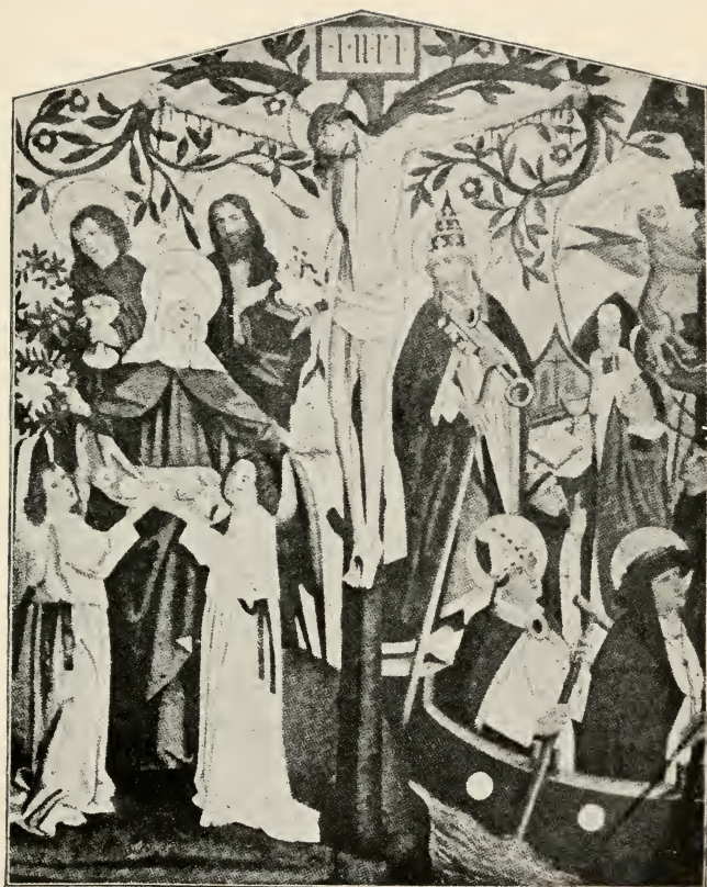
CHRIST ON THE TREE OF LIFE