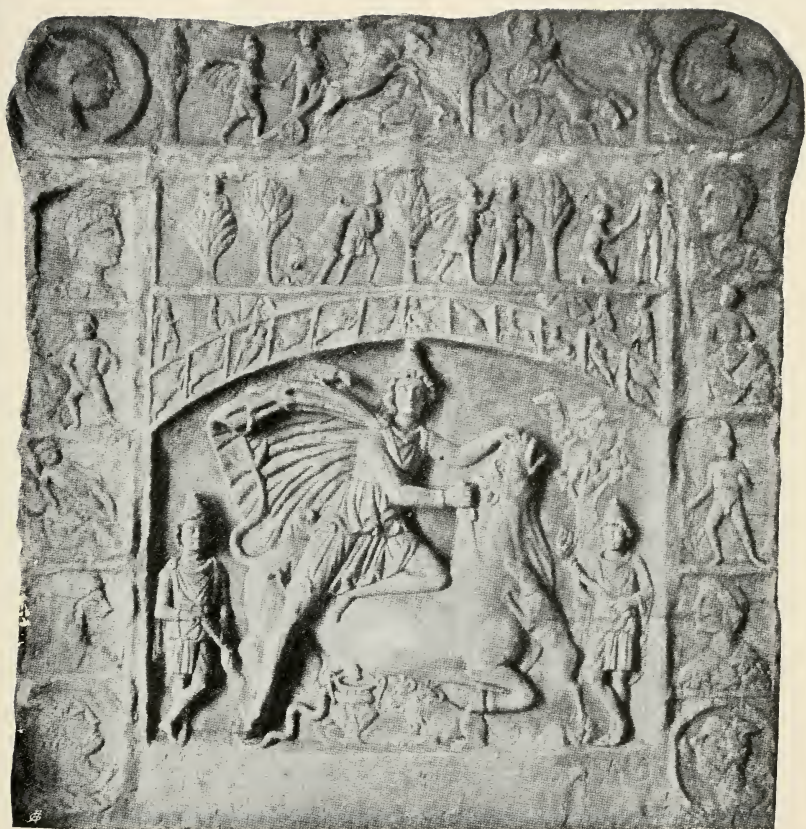
BULL-SACRIFICE OF MITHRA