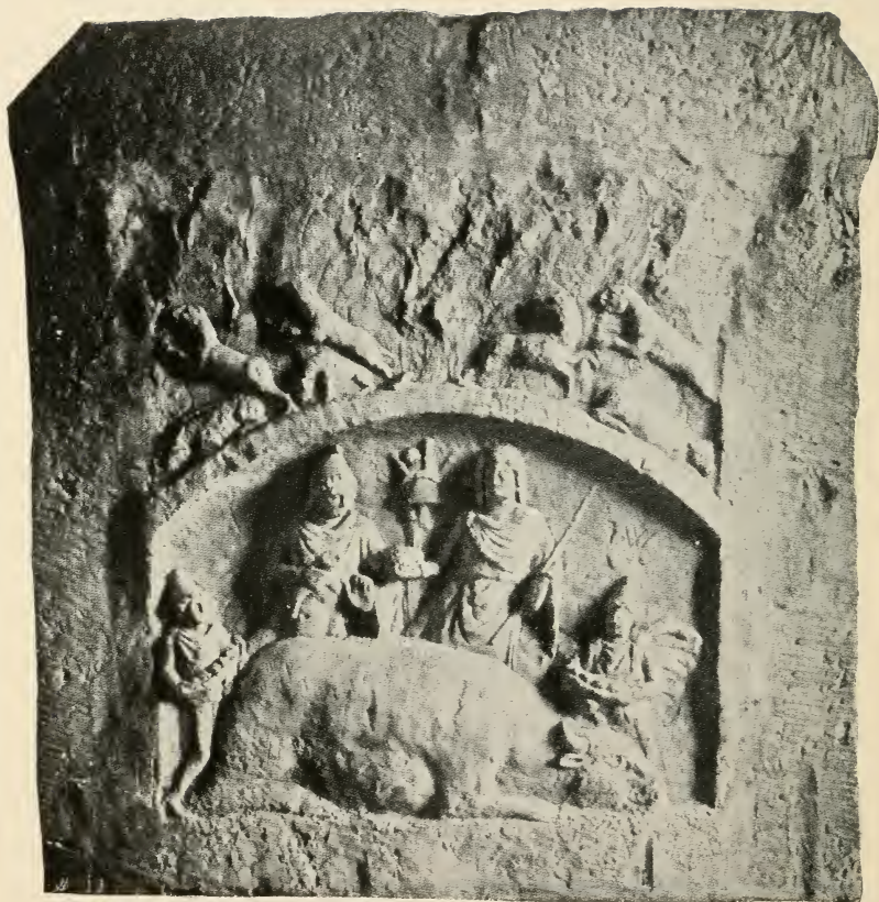
FRUCTIFICATION FOLLOWING UPON THE MITHRAIC SACRIFICE