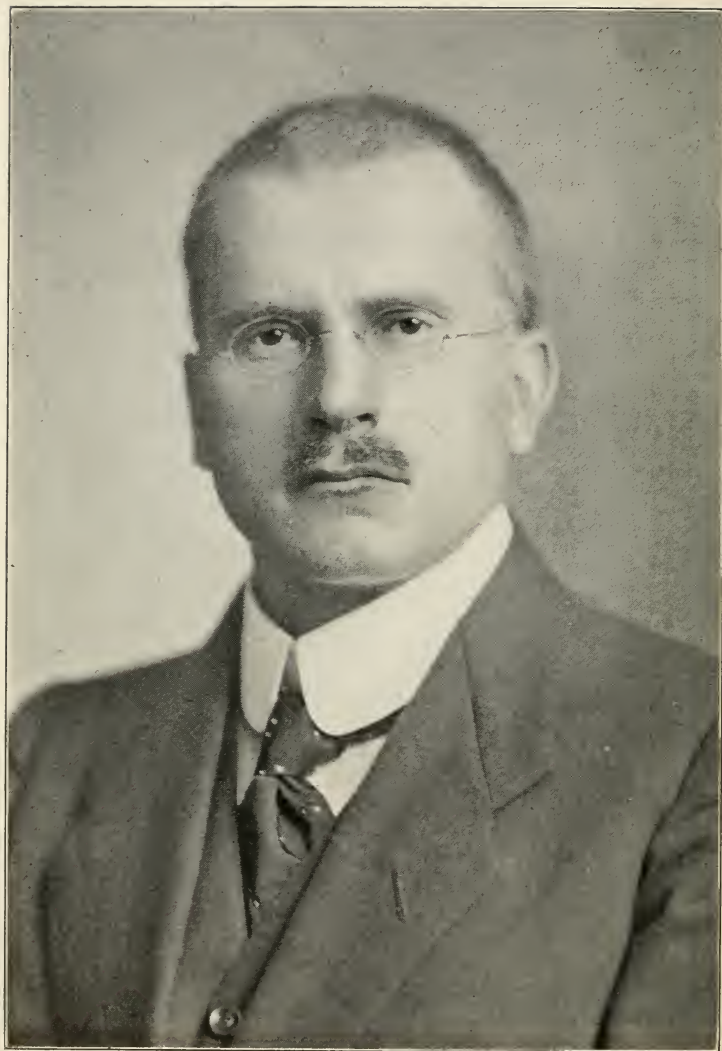
DR. C. G. JUNG "PSYCHOLOGY OF THE UNCONSCIOUS"