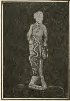
PRIAPUS AND SERPENT

This apparent contrast in the nature of the libido is strikingly illustrated by a Priapic statuette in the antique collection at Verona. 60 Priapus smilingly points with his finger to a snake biting off his "membrum." He carries