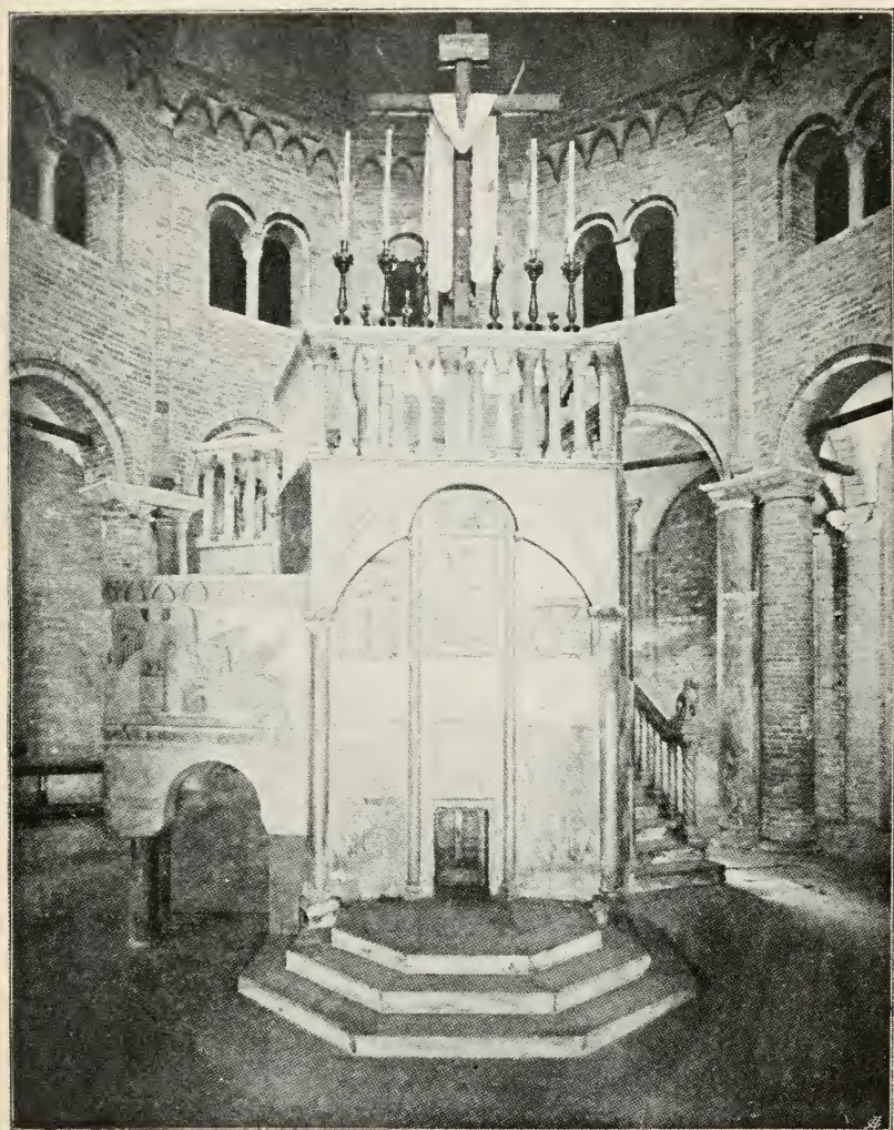
THE SO-CALLED HOLY SEPULCHRE OF S. STEFANO AT BOLOGNA